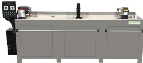
ADH-2045 Long Frame Unit