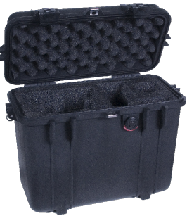
Standard Carrying Case