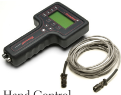
Hand Control (wired model), Cable