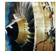
Additional Engine Programs