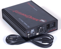
Power Unit (model without video overlay), Power Cable