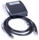
Remote Foot Switch, Cable