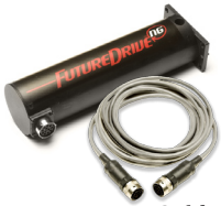
Drive Motor, Cable