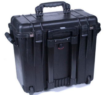
Medium Carrying Case (holds engine adapters)