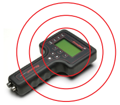
Wireless Hand Control